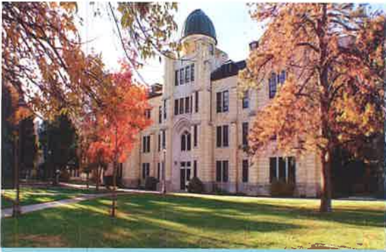
Fort Hays State University