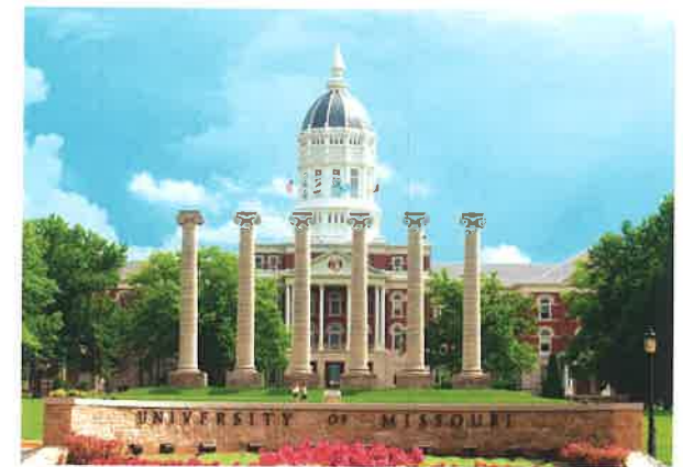
University of Missouri-Columbia

The Hagan Scholarship is a nationwide need-based merit scholarship designed to help rural students graduate college debt-free. Recipients must have financial need and must graduate from one of over 6,000 eligible public high schools listed on the HSF website. The scholarship provides up to $48,000 over four years to attend college and other benefits. Hagan Scholars from 43 states are currently attending 378 colleges and universities. Over six hundred more scholarships can be awarded in April 2022. Visit the HSF website for more information.