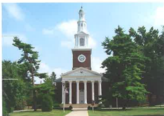
University of Kentucky